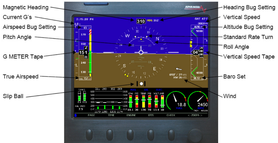
Advanced Flight Systems

whole lot more busy. The subsequent pictures show how the other manufacturers that we heard from in the last article display the same kind of data.